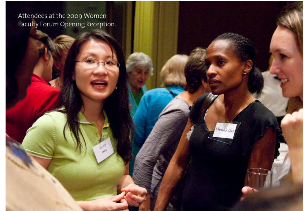
Attendees at the 2009 Women Faculty Forum Opening Reception.