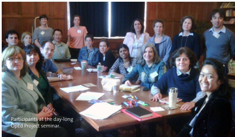
Participants at the day-long OpEd Project seminar.